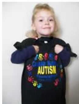
Child/youth CNAF T-shirt

Sizes available Youth Small Youth Medium