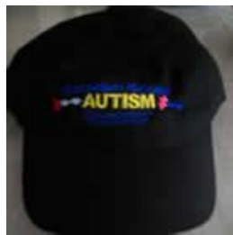
Autism Awareness Baseball Cap with velcro to extend or to make smaller