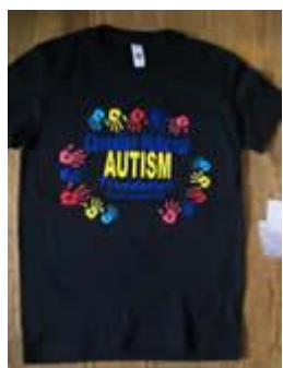
Men's CNAF T-Shirt Sizes Available Sm, Med, Lrg, XL, 2XL, 3XL