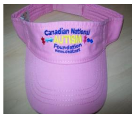
Ladies Pink Visor with velcro to extend or to make smaller