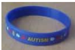
Autism Bracelet (has multi coloured puzzle pieces around it AUTISM printed on one side & cnaf.net on the other side) $3.00 (+ shipping)