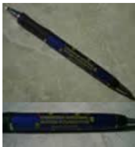
Autism Awareness Pen (blue ink) (CNAF & multi-colour puzzle pieces)