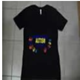
Ladie's V-Neck Some sizes rounded neck (ask us) CNAF T-shirt Sizes Available Sm, Med, Lrg, XL, XXL