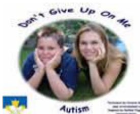
"Don't Give Up On Me (Autism)"