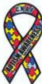
Stick on Decal ( 10 cm x 20 cm approx) 8 inches high $5.00 (+ shipping)