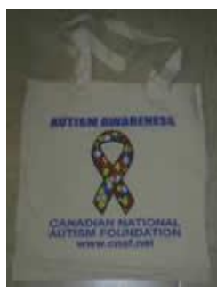
Autism Awareness Bag Made from 100%