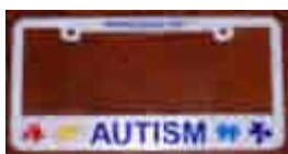
Autism License Plate Cover $5.00 (+ shipping)