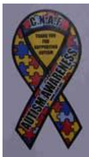
Autism Magnet for Car or Fridge (15cm length, 7cm width) $4.00 (+ shipping)